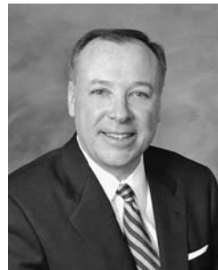
Cook County Commissioner Gregg Goslin

From health care to road repair, Forest Preserves to the courts of law, the issues faced by the Cook County Board are diverse and complex. Recent headlines about the hotly debated 2008 budget and the plans to fill the $300 million deficit have brought the broad scope of Cook