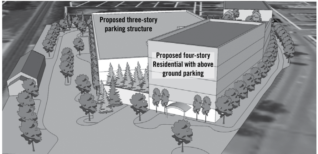
One of seven recommendations by the consultants for downtown includes the addition of a 4-story building with 100 residential units as well as a 3-story parking structure on the site of the West Metra parking lot.

and add new storefronts facing Meadow Road; or completely re-develop the site with a mixture of nearly 100 residential units and 91,000 square feet of commercial space in a combination of a five-story mixed use building and one-story commercial structure.